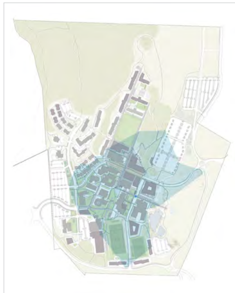
FIGURE 2A FIVE-MINUTE WALK TO TRANSIT

The majority of academic uses, and new residences to the south are accessible within a five-minute walk of transit and the “Main Street” campus core.