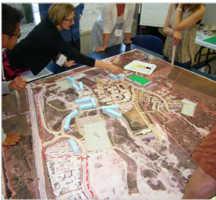
Growth and Experience Design Charrette, June 2014

A description of Phase 1 and 2 public consultation events and how the feedback informed The Campus Plan is included in the Phase 2 Public Consultation Summary Report and The UBC Okanagan Campus Plan 2015 Board of Governor's Report , both under separate cover. Table 1 contains a summary of the main activities in each phase of the planning process.