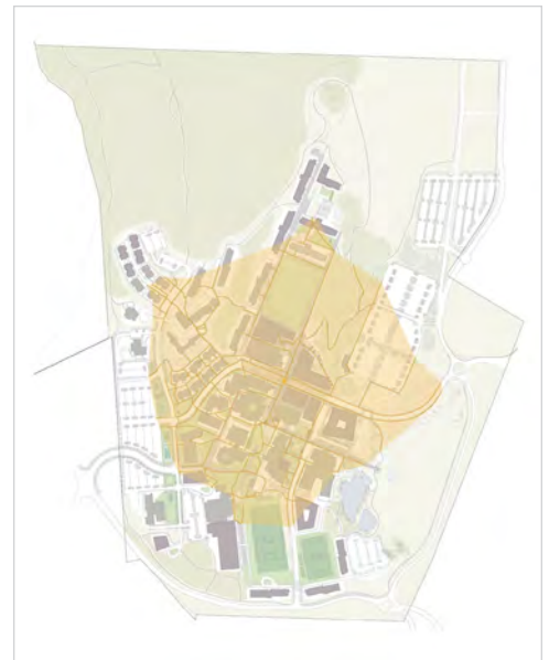
FIGURE 2B FIVE-MINUTE WALK TO CAMPUS CORE