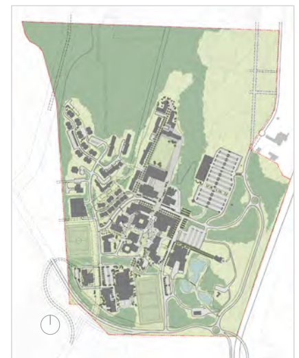
2009 UBC Okanagan Master Plan