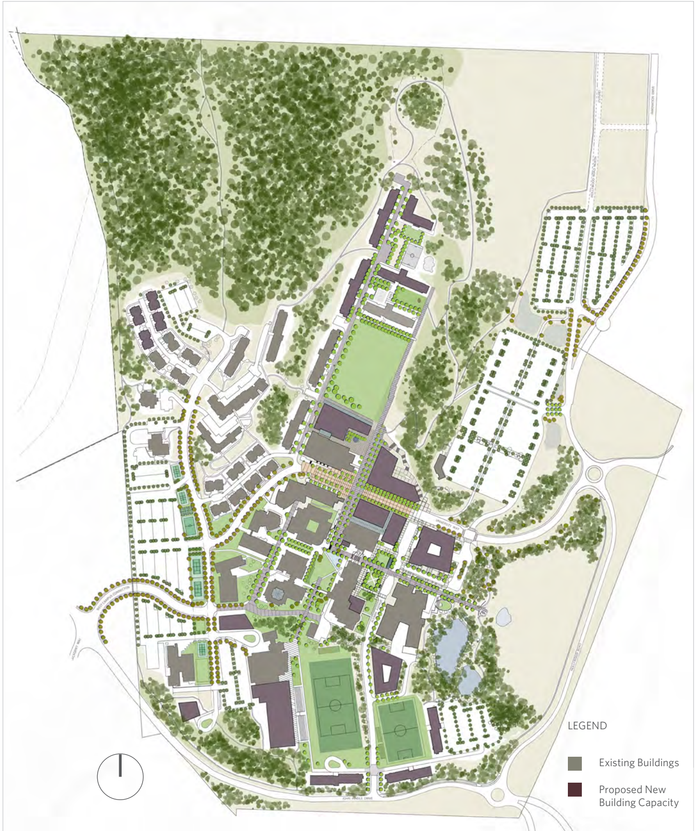
FIGURE 3 ILLUSTRATIVE PLAN OF UBC OKANAGAN CAMPUS