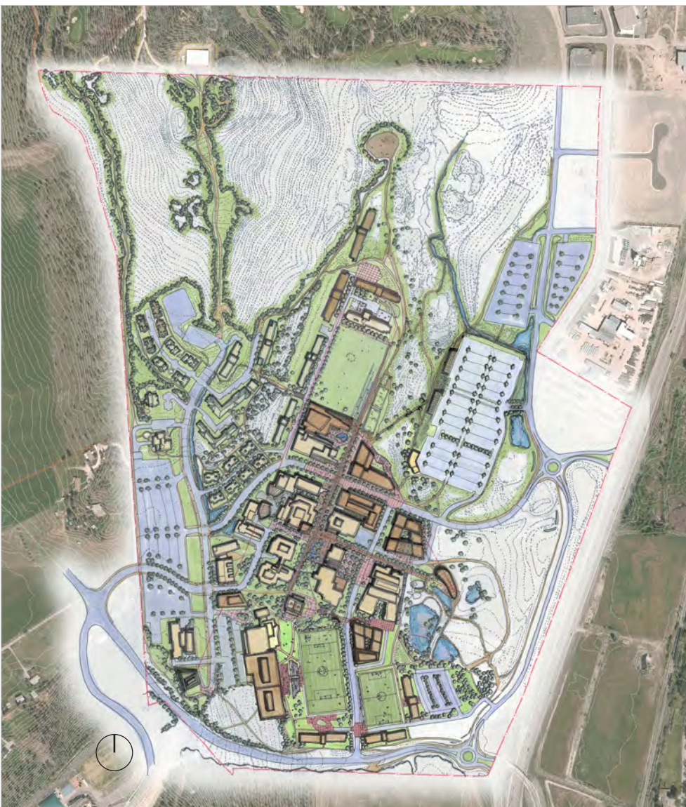
FIGURE 1 PRELIMINARY CAMPUS PLAN CONCEPT