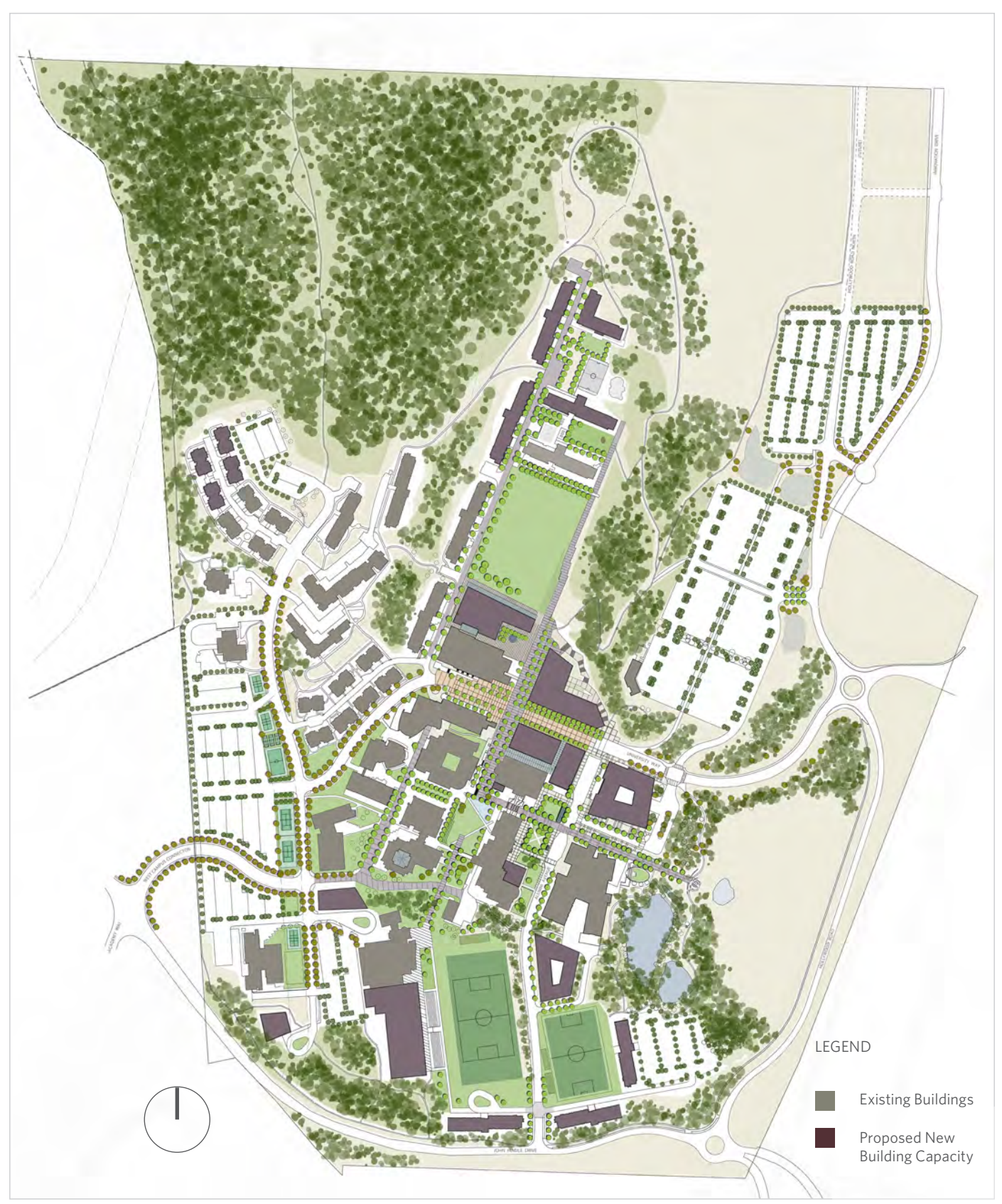
FIGURE 3 ILLUSTRATIVE PLAN OF UBC OKANAGAN CAMPUS