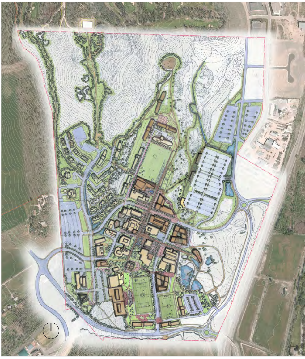
FIGURE 1 PRELIMINARY CAMPUS PLAN CONCEPT