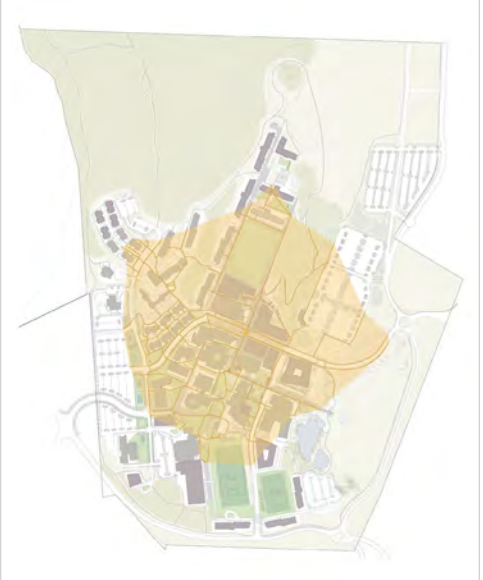
FIGURE 2B FIVE-MINUTE WALK TO CAMPUS CORE

The majority of academic uses, and new residences to the south are accessible within a five-minute walk of transit and the "Main Street" campus core.