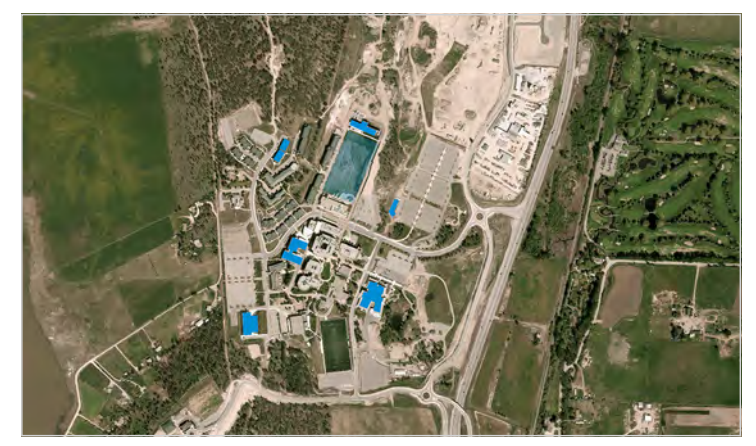
FIGURE 6 UBC OKANAGAN CAMPUS GROWTH SINCE 2000