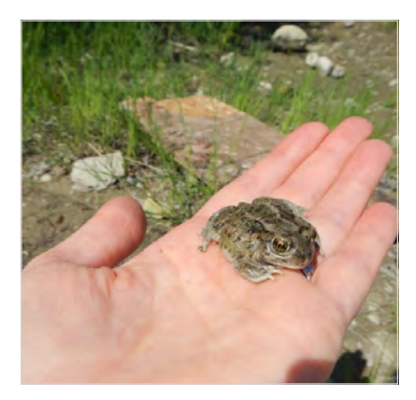
Great Basin Spadefoot Toad