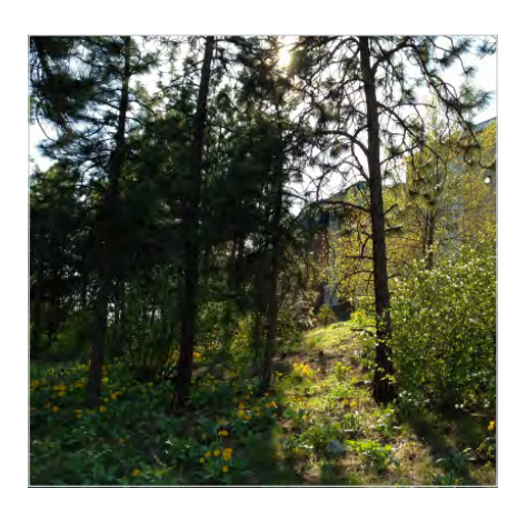
Ponderosa Pine Woodland